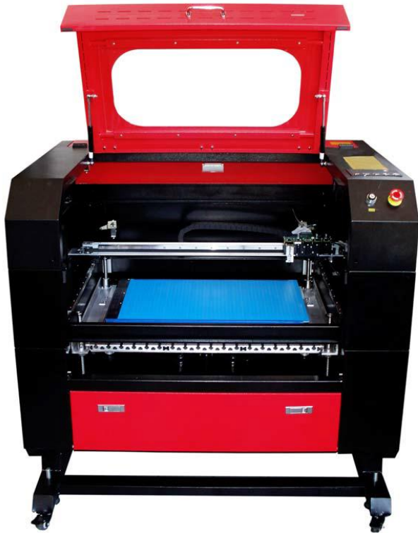
Hyrel3D HYDRA Floor Model HYDRA 640 Shown

Build Volumes up to 600x400x500mm (X/Y/Z)